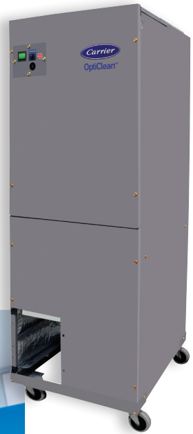
(015 size shown)

Right now, the world is more focused than ever on ways to slow and prevent the spread of disease. With more than a century of expertise in indoor environments, we have developed a solution to help do just that. With the Carrier OptiClean air scrubber, your customers or patients can relax knowing you care about the air they breathe.